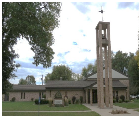
St. Finbarr Catholic Church 504 1 st St SW, Grand Meadow, MN 55936 Saturday Mass @ 5:00 PM