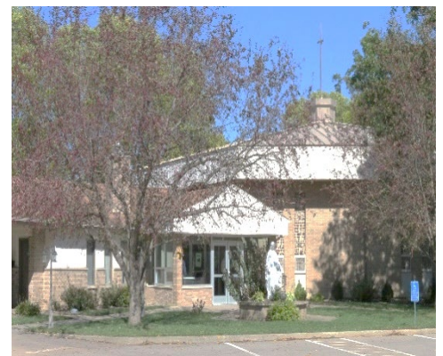
St. Ignatius Catholic Church 213 W Franklin St, Spring Valley, MN 55975 Sunday Mass @ 10:30 AM