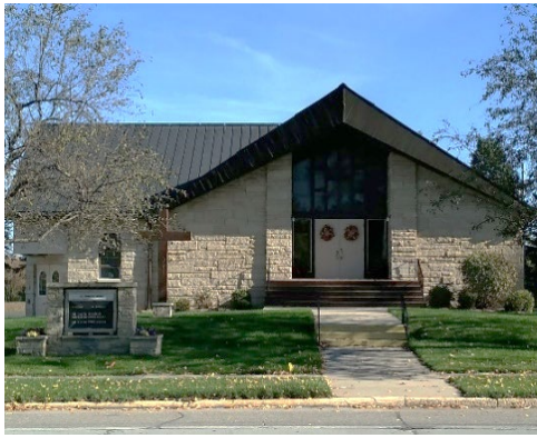
St. Patrick Catholic Church 436 W Main St, LeRoy, MN 55951 Sunday Mass @ 8:30 AM