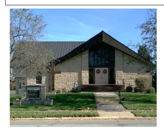
St. Patrick Catholic Church 436 W Main St, LeRoy, MN 55951 Sunday Mass @ 8:30 AM