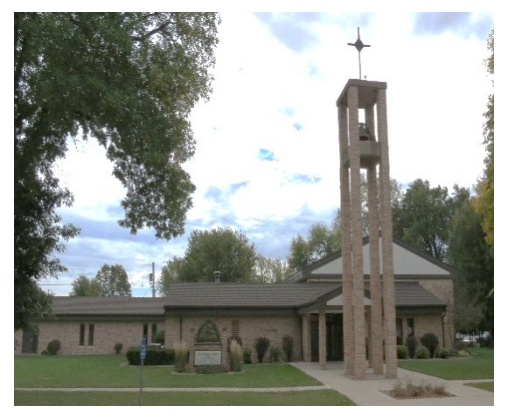
St. Finbarr Catholic Church 504 1" St SW, Grand Meadow, MN 55936 Saturday Mass @ 5:00 PM