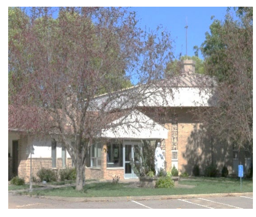
St. Ignatius Catholic Church 213 W Franklin St, Spring Valley, MN 55975 Sunday Mass @ 10:30 AM